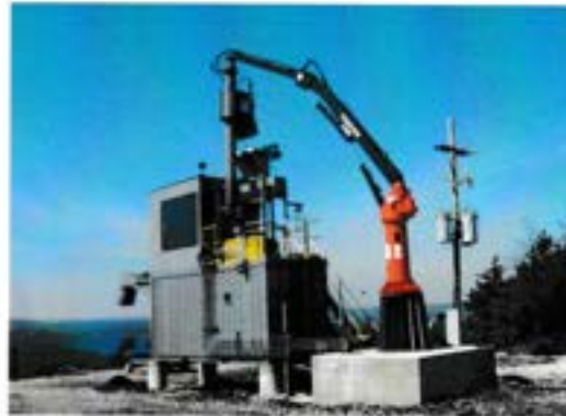
Modular Truck Auger