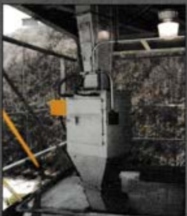
Secondary Traveling Hopper Sampler Hydraulic Drive