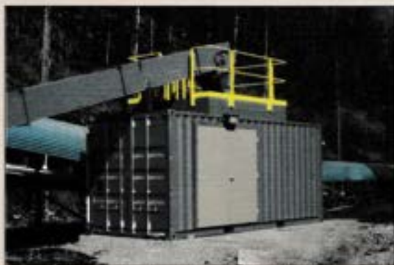
Modular Processing Building

PSI excels at turnkey installations of our mechanical sampling systems. A dedicated team is assigned to each phase of the project, from the initial design concept through erection and start-up, to assure a quality product.