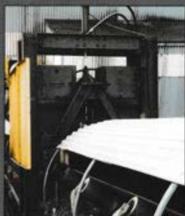
Primary Rotary Sweep Sampler Hydraulic Drive