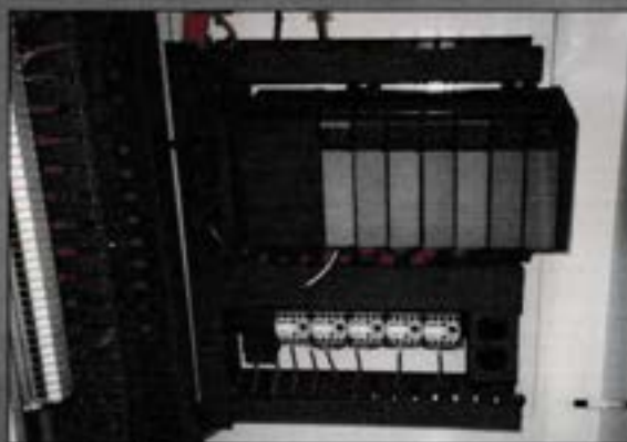
State-Of-The-Art Control Systems