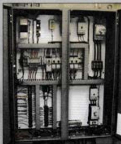
State-Of-The-Art PLC Control Systems