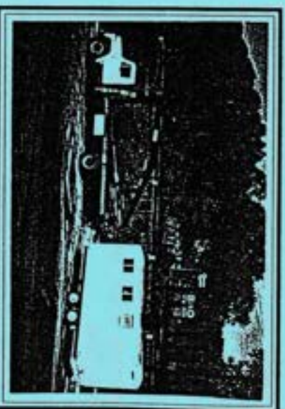
Truck Mounted Auger and Portable Processing Station