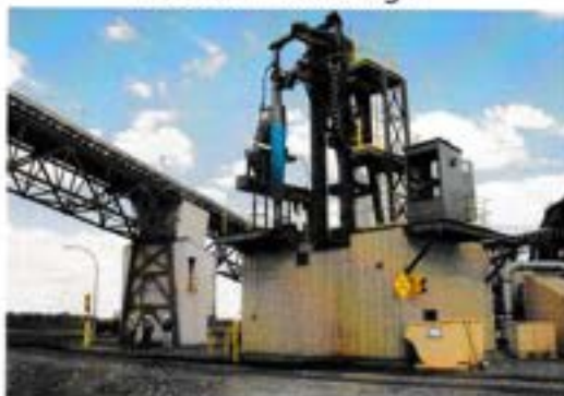
Automated Truck Auger