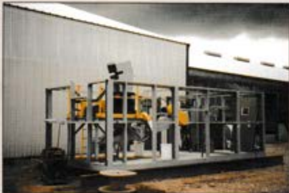
Modular Processing Building

PSI excels at turnkey installations of our mechanical sampling systems. A dedicated team is assigned to each phase of the project, from the initial design concept through erection and start-up, to assure a quality product.