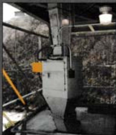
Secondary Traveling Hopper Sampler Hydraulic Drive