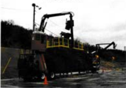
Trailer Mounted Auger