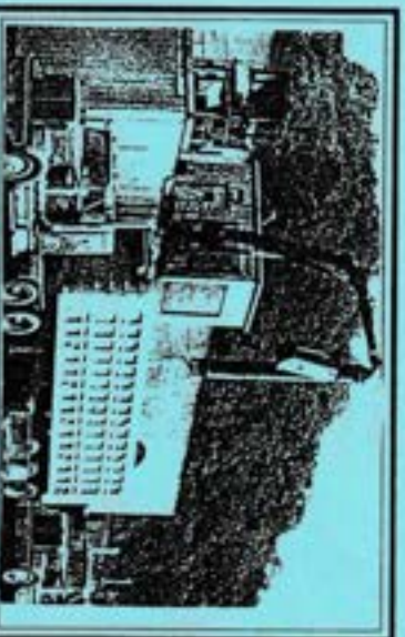
Shown is the PSI truck auger sampling system for in-bound coal at Big Sandy Terminal.

* Trailer-Mounted Auger Complete sample reduction and reject handling. Unit is readily transportable.