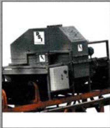
Primary Rotary Sweep Sampler W/Electric Drive