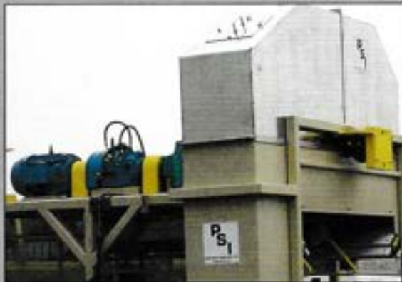
Rotary Sweep Sampler Electric Drive W/Hydro-Static Clutch