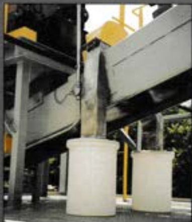
Secondary Rotary Sweep Sampler Reversible Electric Drive