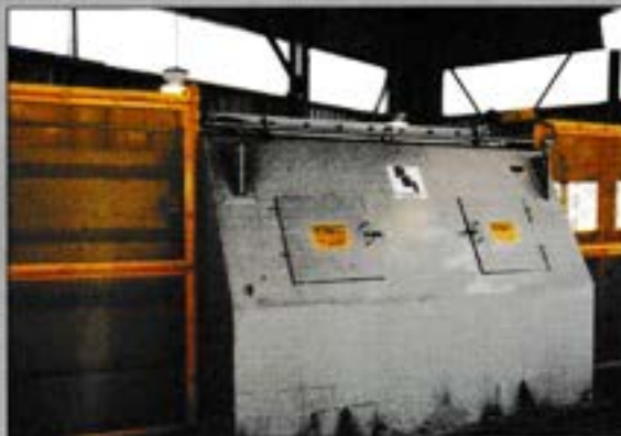
Primary Baffle Plate Sampler Electric or Hydraulic Drive