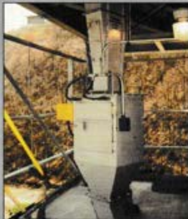
Traveling Hopper Secondary Sampler Electric or Hydraulic Drive