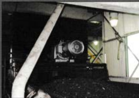
Primary Rotary Sweep Sampler Electric Drive