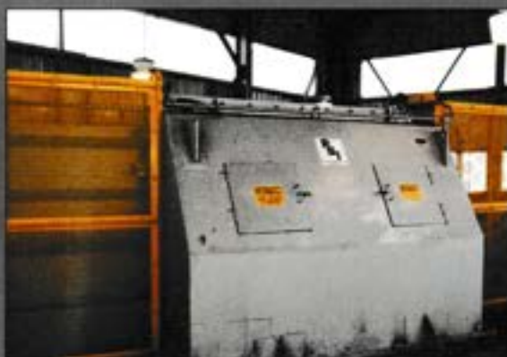
Primary Baffle Plate Sampler Hydraulic Drive