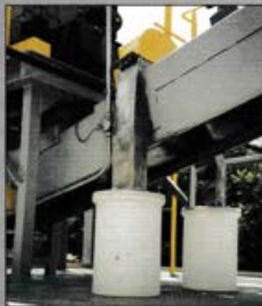
Secondary Rotary Sweep Sampler Reversible Electric Drive